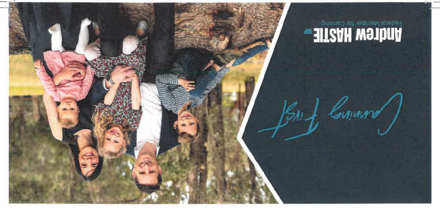
Released by the Department of Finance under the Freedom of Information Act 1982