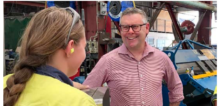
Senator Murray Watt with a Queensland apprentice.

Murray Watt Labor Senator for Queensland