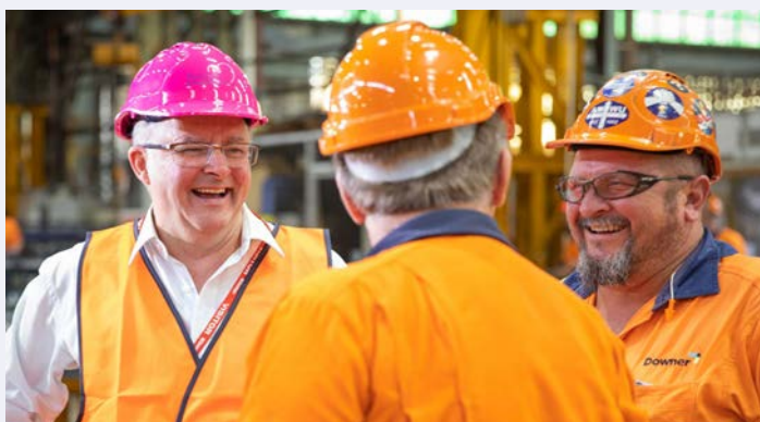
Labor leader Anthony Albanese with Queensland manufacturing workers.

Over the last six months, we've been hard at work helping Everton residents cope with the effects of COVID-19.