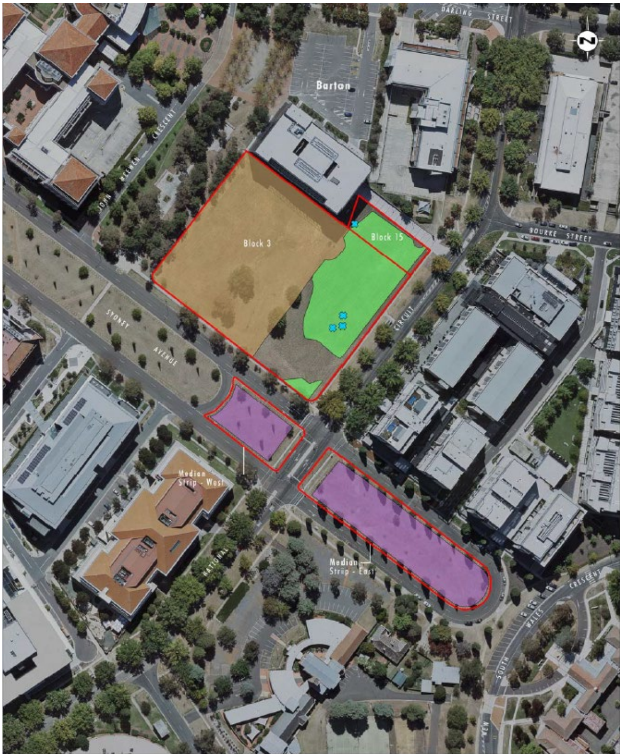
Map 1: Barton site - GSM habitat prior to the site been cleared