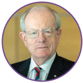
The Hon Paul Brereton AM RFD SC , Commissioner, National Anti-Corruption Commission.