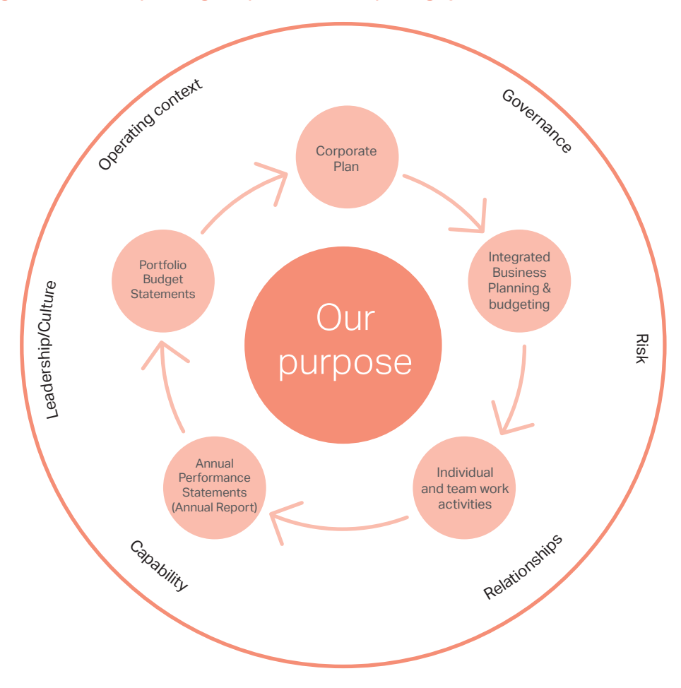
Figure 4: Finance's planning and performance reporting cycle

The operating model allows Finance to adjust its activities and resourcing to align with government priorities as expressed in the department's Corporate Plan and measured through the annual performance statements. Figure 4 illustrates Finance's approach to planning and reporting.