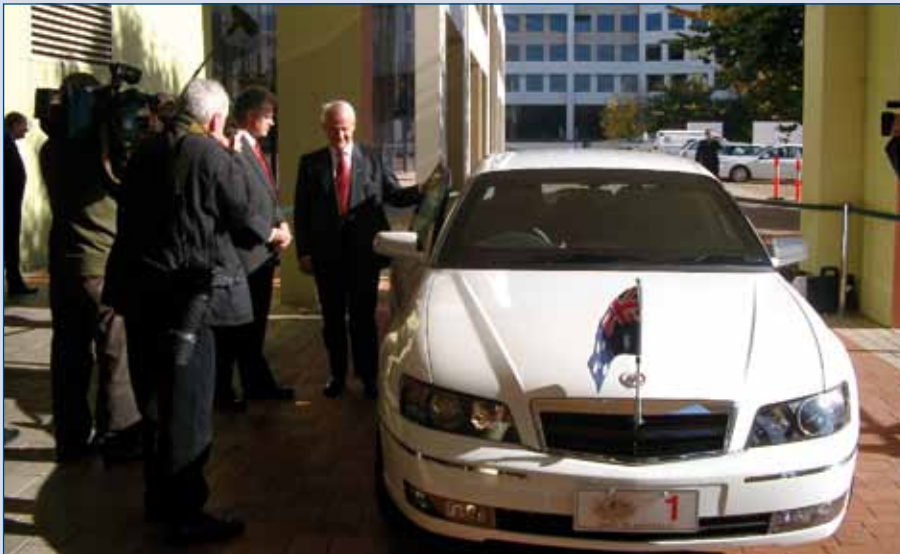
Minister Philip Ruddock and Gary Barklay at the launch of the first protected vehicle modified in Australia.

The 2007 election, with the change of government, ushered in a new political chapter in Australia. It remained to be seen whether or not the change of government corresponded with a new period of change for COMCAR.