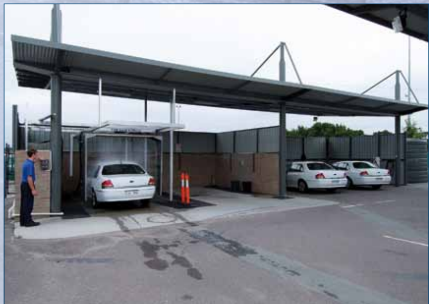
Car wash at the ACT depot.

The prolonged drought prompted introduction of water restrictions in all of the nation's capitals and prevented COMCAR from using car washing facilities in depots where there were no facilities for recycling water. Drivers in Melbourne had to use washing facilities at a commercial service station once water restrictions were enforced in Melbourne in early 2007. This continued until 7 February 2008 when a 20,000 litre water tank was installed to harvest rain from the large depot roof; the capacity of the tank when full provided for up to 2000 washes.