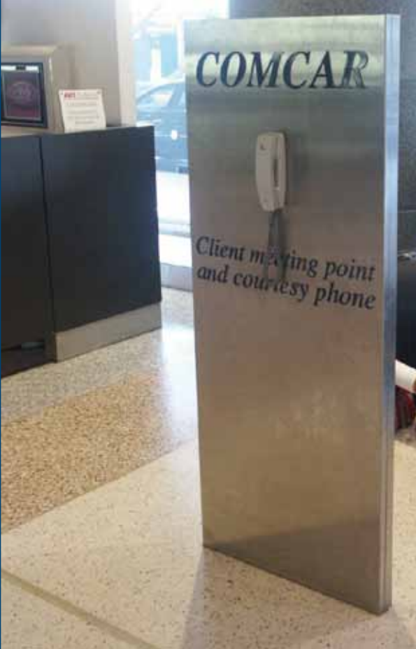
COMCAR telephone at Qantas terminal, Sydney airport, 2007.

Meanwhile, other initiatives were implemented to boost productivity. One of the more important was the provision of better facilities in all locations, all of them close to airports, which were now a major focus of operations. Both the national office and the Australian Capital Territory depot were co-located on the one site at Dairy Road, Fyshwick, when Special Minister of State, Senator Eric Abetz, and the Secretary of the Department of Finance, Dr Ian Watt, opened the new complex on 28 April 2003. The ACT depot had previously been at Hume, while the national office had been at 111 Canberra Avenue at Kingston. A feature was the inclusion of a gym to assist with endeavours to ensure that drivers remained fit and healthy. Those in the ACT depot were apprehensive about having the national office so close, but concerns dissipated as the independence of each was respected and maintained.