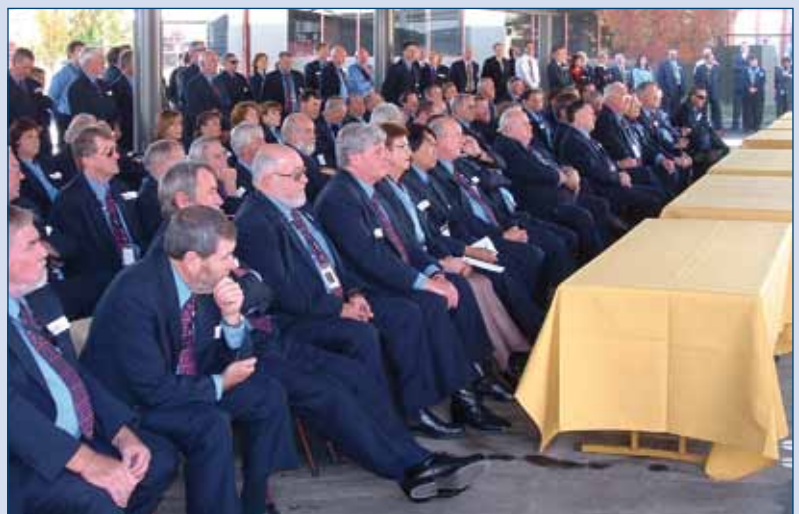
Drivers at the opening of the new ACT depot, 28.4.2003.

Meanwhile negotiations began on a new certified agreement, though one based on a union rather than a general staff agreement. This proved more attractive to all concerned and in a short time there was a drivers-only certified agreement. A key to the new agreement was the minimum call-out period of two rather than four hours – three hours in Sydney and Melbourne – which meant that short-term work was wrested back from hire cars. The use of hire cars decreased from 10 per cent to 7 per cent and meant more work available for all drivers.