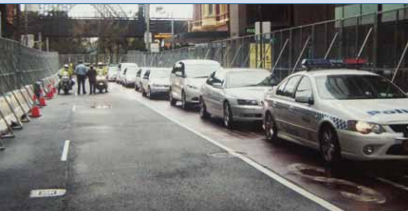
The barricading of Sydney streets for the 2007 APEC meeting presented a challenge to drivers and supervisors.

APEC 2007 was undoubtedly the biggest event in which COMCAR had been involved. It proved a great advertisement for the organisation and boosted the morale of all drivers and administrative personnel involved.